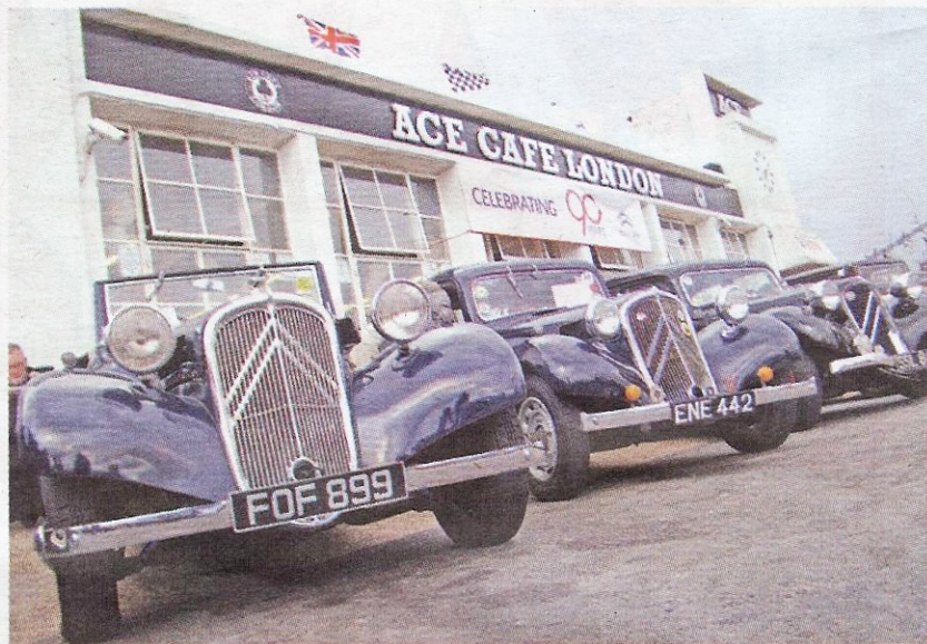
A rare Traction Avant roadster poses next to an even rarer fixed-head coupé, the latter owned by Barry Annells of Bourne. Both were actually built in the British Slough factory