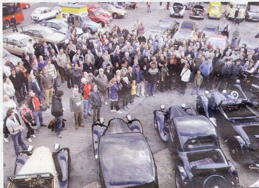
This amazing gathering attracted people from all over the UK