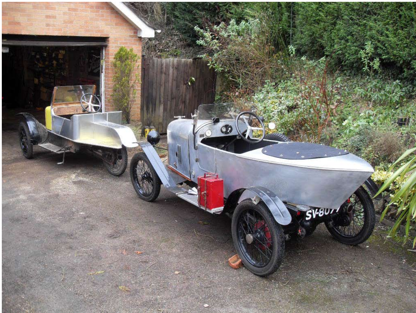
Mike Tebbett's 1925 Amilcar C4 and 1922 LSD Cyclecar

Entry £5 per person (under 12's free). It will be well worth hanging on at the end of the day - the famous Vulcan will fly over Turweston Aerodrome at approximately 4.45pm. Don't miss the opportunity to see this wonderful aeroplane in flight.